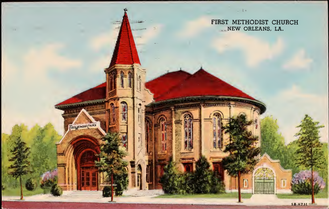
FIRST METHODIST CHURCH NEW ORLEANS, LA.